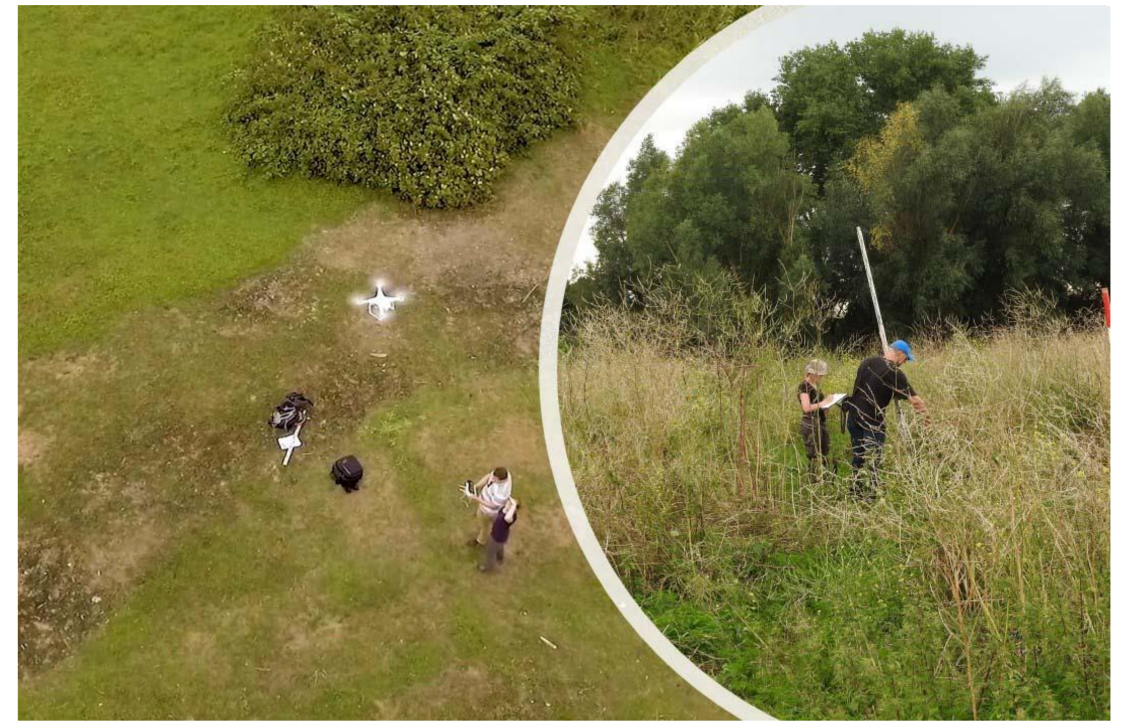
Fieldwork involving image acquisition and field measurements

Tests at other locations and contexts using new sensor types to widen the field application of the developed methods.